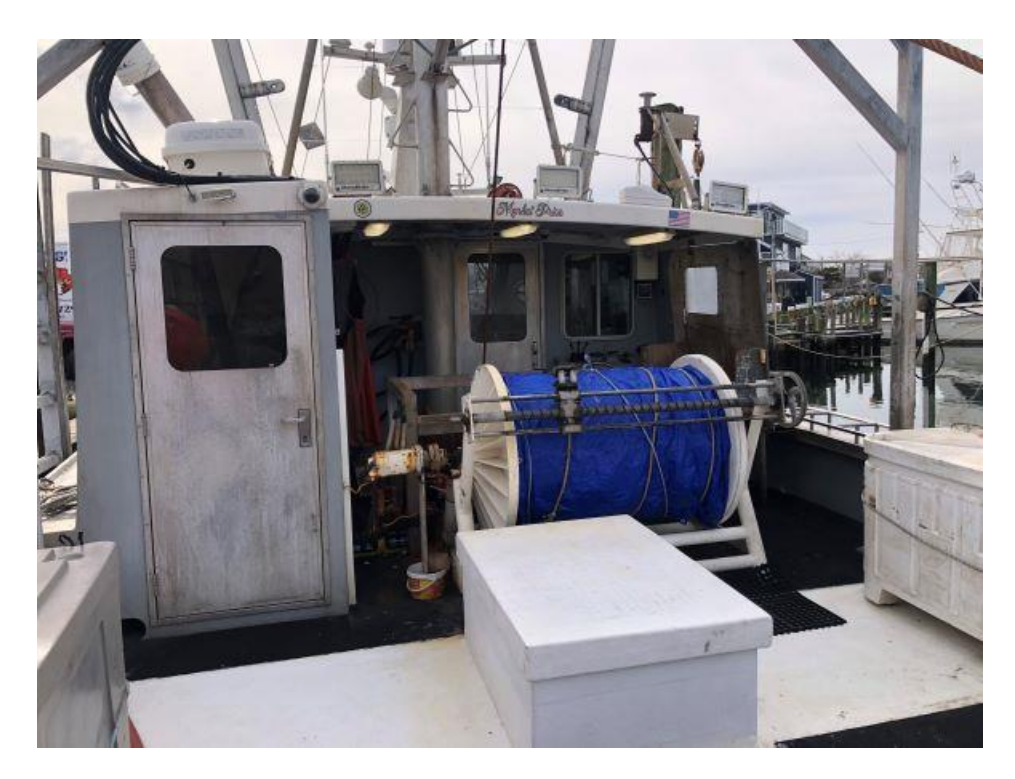
5. Main deck, looking forward.

F/V MARKET PRICE, as surveyed on February 7, 2023, while the vessel was afloat at Point Pleasant, New Jersey