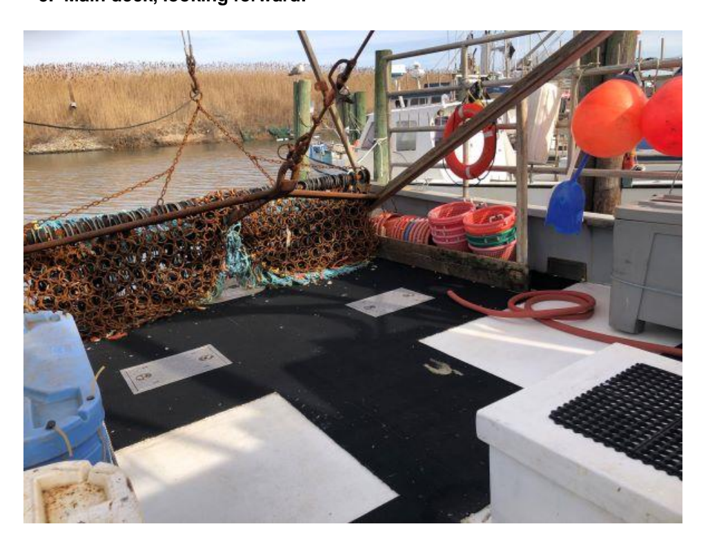
6. Main deck, looking aft.